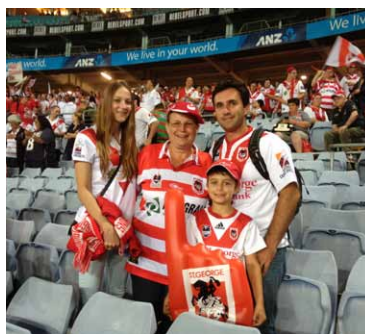
Winners are Grinners: A few members of the Era team celebrating a recent win for the Dragons.

AND if you ever visit Samos Dio, you will find the cleanest, most pristine looking motorcycle in the car park!